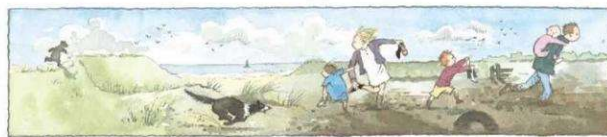
Back through the mud! Squelch squerch! Squelch squerch!

one your child takes to bed) before they wake up or last things at night so that they can look for the bear after their breakfast - whenever suits you. In Nursery we had a laminated and cut out photo of a Gingerbread Man who the children loved searching for - one day he was even stuck to the ceiling! You can be inventive with hiding places - sitting inside the washing machine, in the bath, under a blanket or behind the plants in the garden. That Teddy can be a bit of a cheeky one! Perhaps your child could hide the Teddy for you to find? Children love it if you pretend that you just can't find it and they have to help! Have fun!