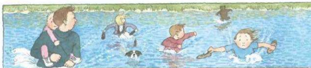
Back through the river! Splash splosh! Splash splosh! Splash splosh!