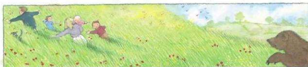
Back through the grass! Swishy swashy! Swishy swashy!